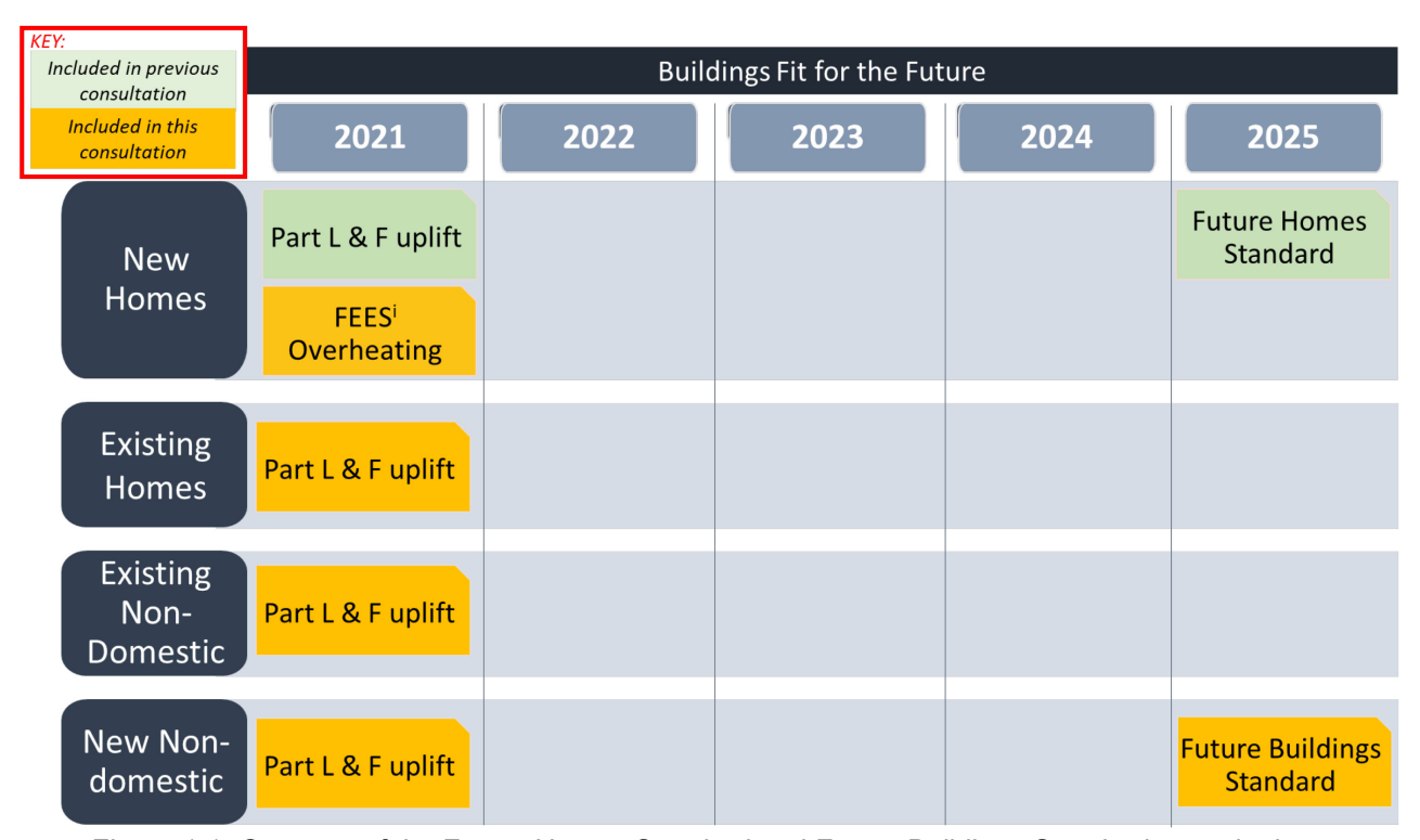
Figure 1.1: Contents of the Future Homes Standard and Future Buildings Standard consultations. i - The Fabric Energy Efficiency Standard (FEES) is being reconsulted on in this consultation, alongside some building services standards and guidance on the calibration of devices that carry out airtightness testing.

1.4.1. We believe that the Future Homes Standard, the Future Buildings Standard and the uplift in standards to be introduced in 2021 provide a pathway for buildings that are fit for the future. How these different elements are interlinked is shown in Figure 1.1 below. Those items shown in green were the subject of the first part of this two-stage consultation, the Future Homes Standard consultation, published in October 2019. Those items in orange are the subject of this consultation.