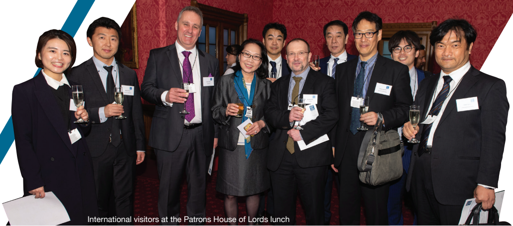
International visitors at the Patrons House of Lords lunch