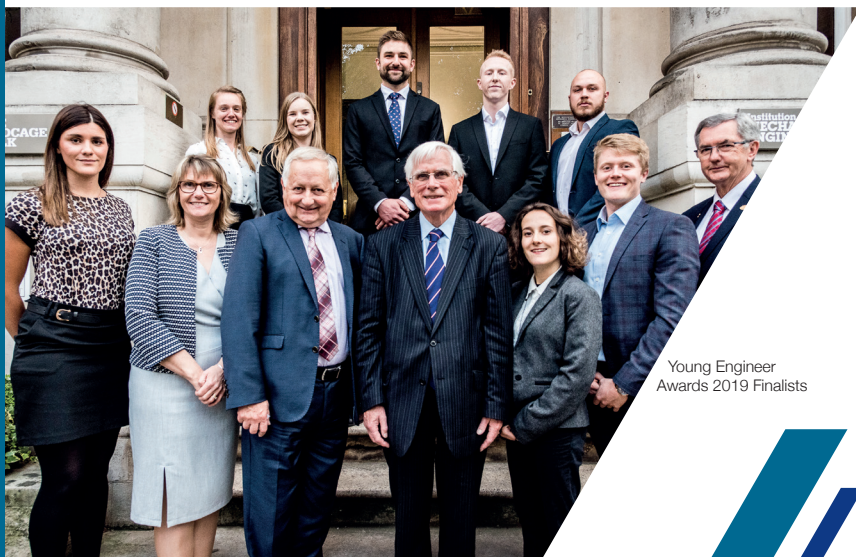
Young Engineer Awards 2019 Finalists

Thank you for your support and please enjoy our celebration.