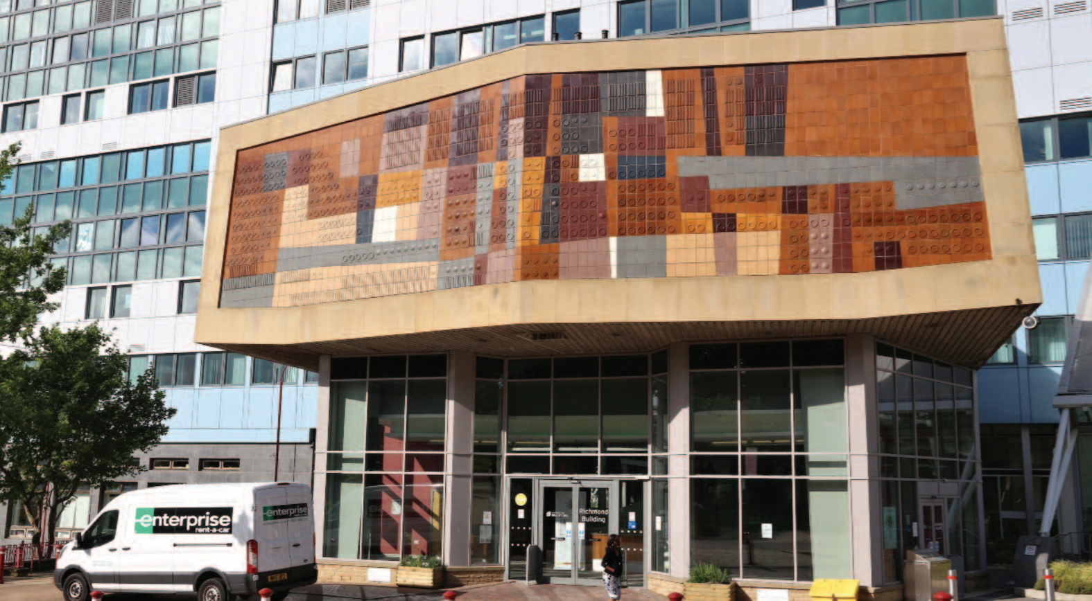
University of Bradford

many years. But, by tearing up the rule book on what we thought was appropriate with older buildings, the skills of the building services engineers delivered the only University campus in the world with three 'BREEAM Outstanding' buildings and a Passivhaus building within 100 metres of each other. The completed project has rejuvenated the campus and the art of engineering is spread across the whole University. It is now not merely functional: it