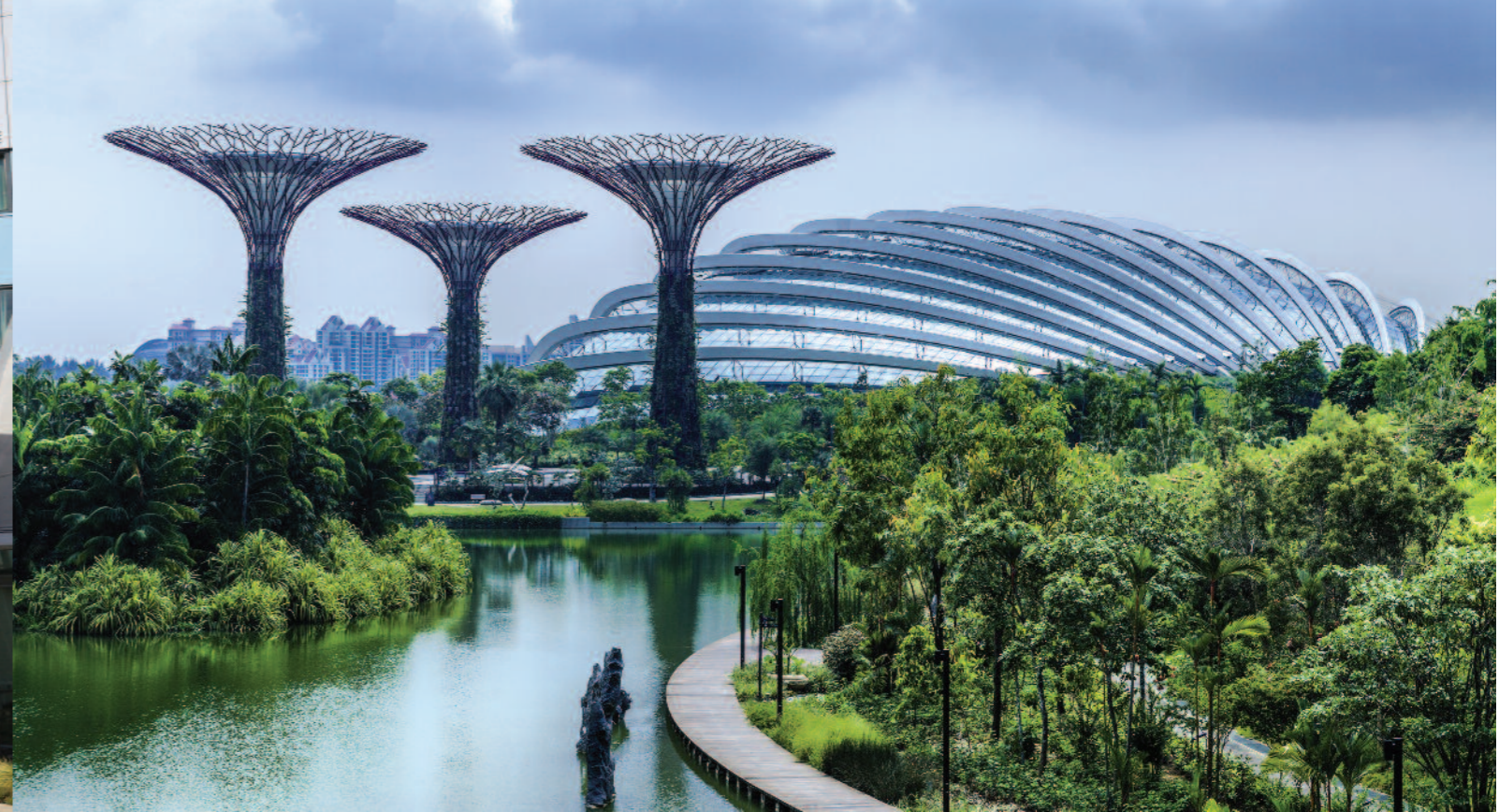
The Gardens by the Bay project in Singapore

Art is often about making a breakthrough, not merely a successful copy. CIBSE members are ready and prepared to go beyond what we thought was possible. Let's look at another example.