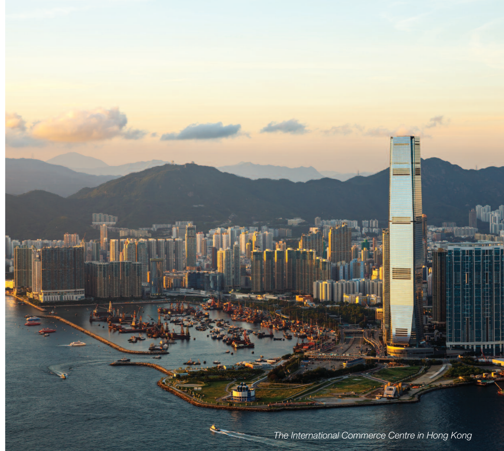
The International Commerce Centre in Hong Kong

The other recent Award winner, the University of Bradford, is a double winner of the CIBSE Building Performance Champion Award. The estate was mostly built in the 60s and early 70s and delivered sub-optimal performance for