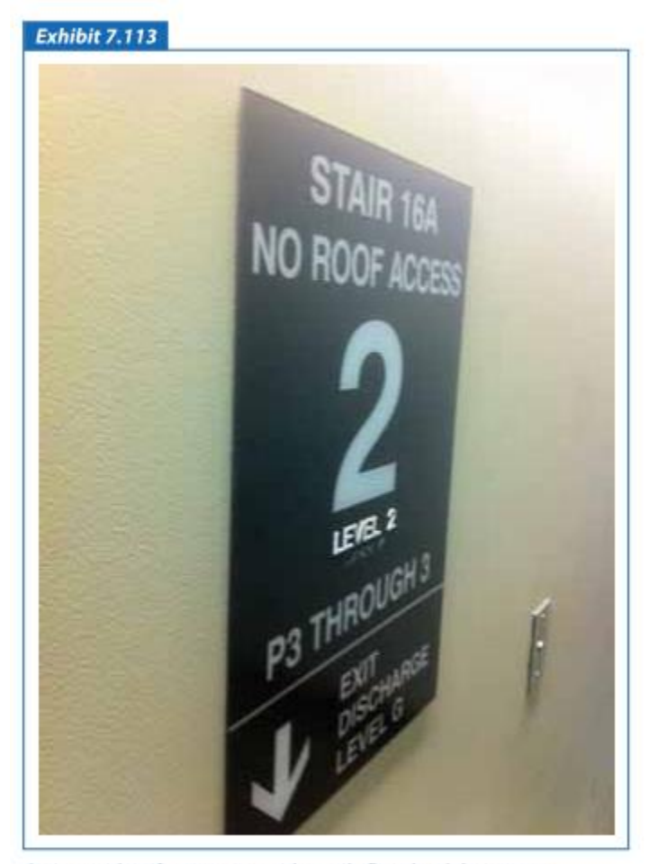
Stairway identification sign with tactile floor level designator.